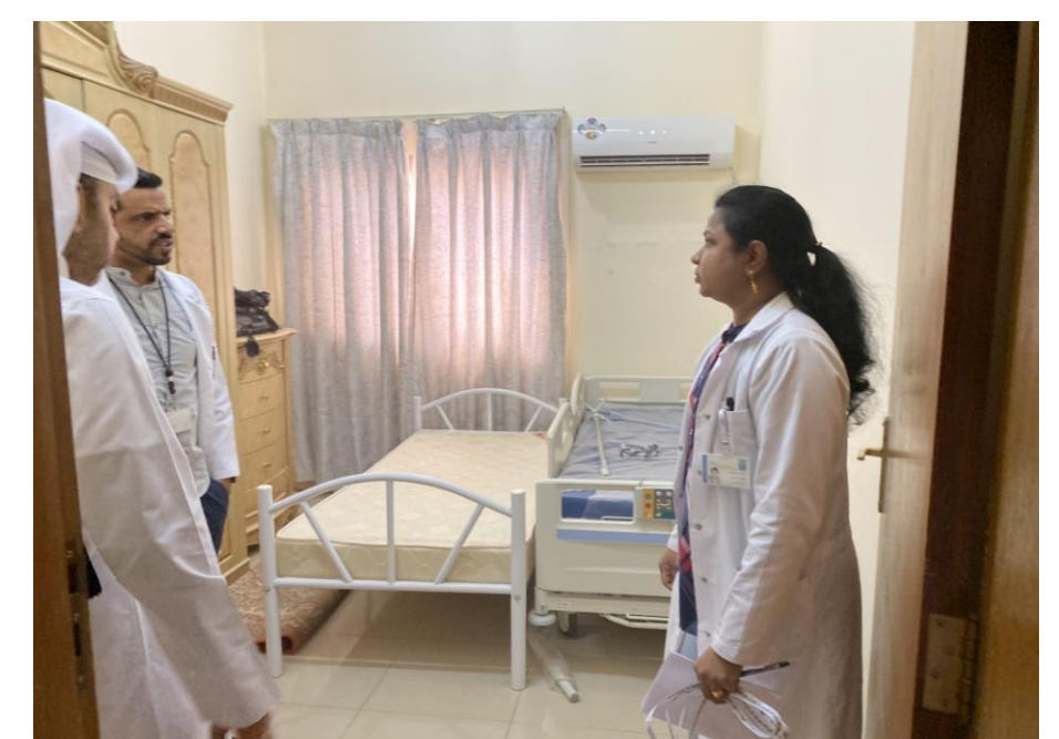
Home visit and recommendation