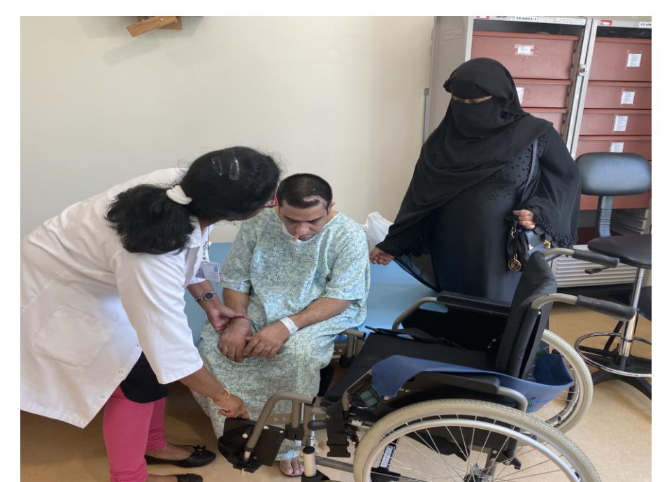
Wheelchair/ Equipment Education