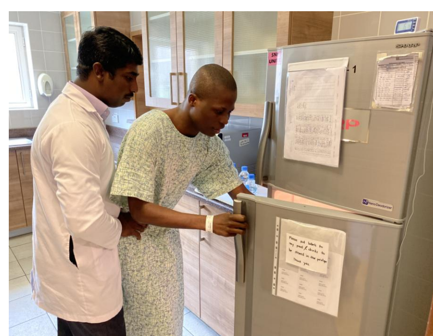
Household ambulation and Functional abilities