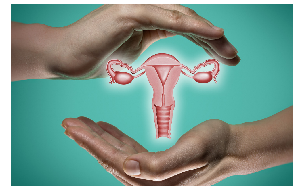
Women Reproductive Health