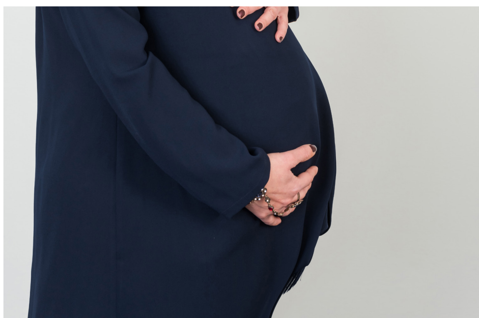
Your Health in Pregnancy